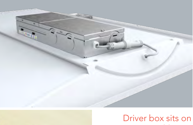
top of fixture

Distributors who need to stock the simplest solutions for their clients while maximizing their shelf space.