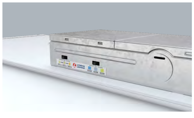
Switchable ALO and CCT