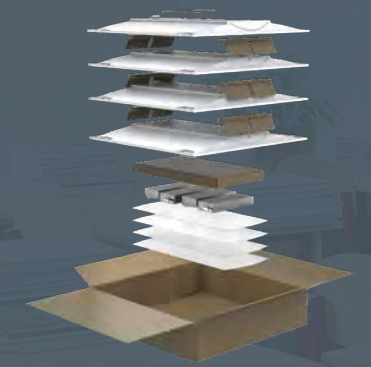
Four 2'x2' fixtures ship per one box

Design Builders who want the quality and reliability of a Lithonia Lighting® lay-in at a competitive price.