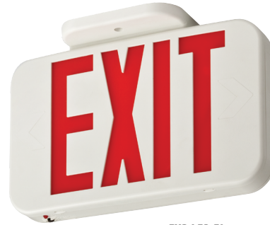
EXR LED EL